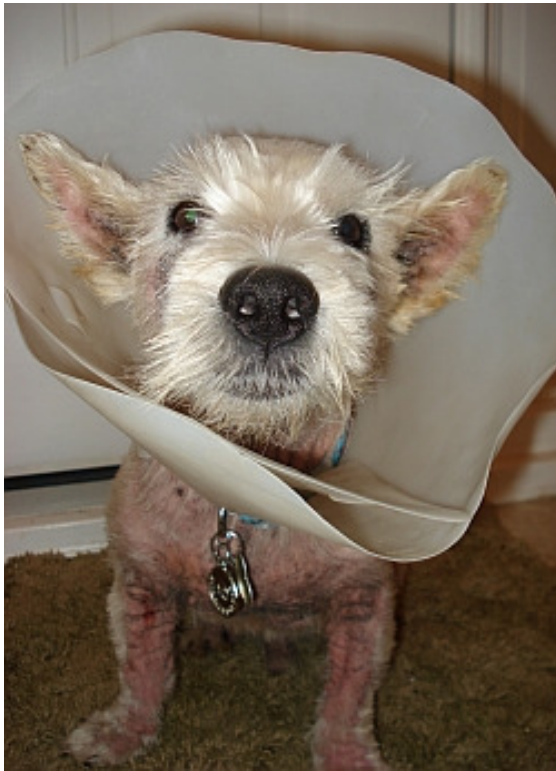
this was Sammy on Aug 19 th

Use a Calendar: We strongly suggest that you keep a calendar handy that just has your Westies' health info on it. When you record daily changes, changes to foods, snacks or treats, changes with tummy upsets, scale of itchiness, etc... very often you will begin to see patterns that will help you when treating your dog.