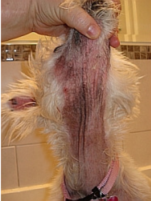
This was Sugar on July 5th