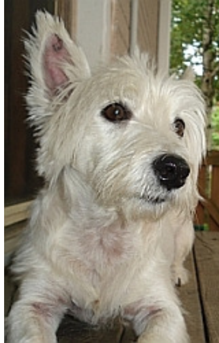
and this was Sugar on August 19th

Lotions and Potions: We have found a product that we have used on our itchy Westies that has been great for us. It is in a shampoo, cream and spray form and it has worked wonderfully well to give our dogs relief. It is called Dermacton and can be purchased in Canada from The Healthy Dog Store .