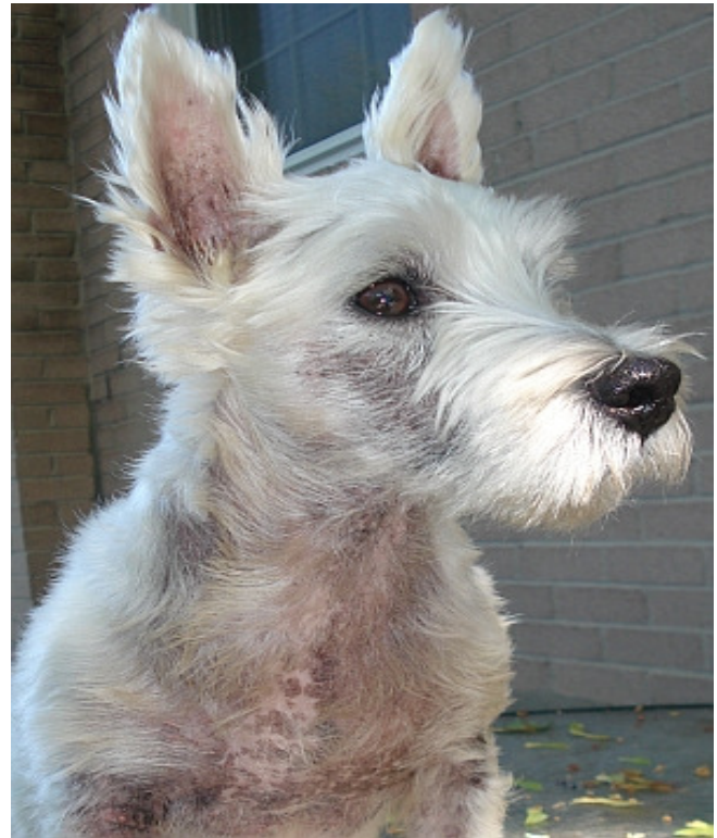
and this was Sammy on September 27th

Shampoo: It is VERY important to bath your itchy Westie...you must get the bacteria and yeast spores off the skin. We would suggest a bath every other day until the yeasty smell starts to dissipate and then every 3 rd or 4 th day till you see that the skin is looking less "angry". If the problem is over most of the body you may want to shave or trim them down, you'll waste less shampoo and they